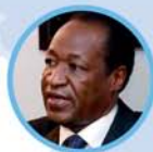
President Blaise COMPAORÉ